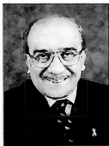
Professor Kader Asmal Chair, World Commission on Dams

If politics is the art of the possible, this document is a work of art. It redefines what is possible to all of us, for all of us, at a time when water pressure on governments has never been more intense. Consider: on this blue planet, less than 2.5% of our water is fresh, less than 33% of fresh water is fluid, less than 1.7% of fluid water runs in streams. And we have been stopping even these. We dammed half our world's rivers at unprecedented rates of one per hour, and at unprecedented scales of over 45 000 dams more than four storeys high.