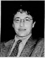
Mr Achim Steiner WCD Secretary-General, Germany

Report is the test against which that process will be measured. We hope that the policy framework and practical guidelines for its implementation presented here will add significant value to existing norms and form a basis for best practice in water and energy development. This is only a beginning, but we hope it is a dynamic beginning that others can take forward in the future. We also hope that the lessons learnt from our analysis of large dams will be seen as relevant for other large infrastructural projects, and that the framework of policy development and implementation we have identified will see wider application.